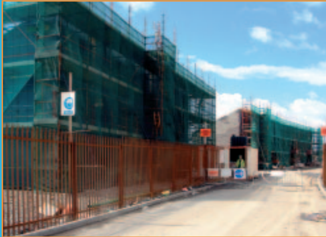
Work in progress on Gateway housing

By now the Ballymun roundabout and pedestrian underpass are but distant memories as the Masterplan vision for the New Ballymun Main Street moves closer to reality each day that Carey's workmen spend on it. The new buildings which will form the frontage of the new main street. The Gateway housing and Civic Offices are shooting up on either side of the street, Axis opened last year, the sports and leisure complex should go on site shortly, and work is progressing on the design of the shopping centre revamp.