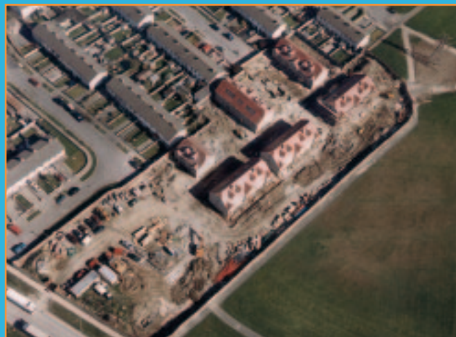
Tigh Meitheal Co-Op scheme of 22 dwellings on site in Ballymun

In addition to these locally run co-ops the National Association of Building Co-Ops has already in place planning permission for its scheme in Poppintree for 80 units. They are not yet looking for members but anyone wishing to register their name should contact BRL. This scheme should be on site by the end of