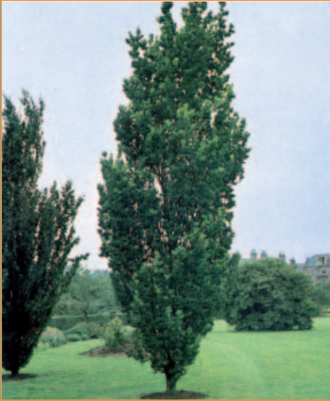
New Trees for Sillogue

The extensive planting scheme for the Sillogue 3a scheme included the planting of 7 native oak trees, 13 native birch trees and 17 flowering cherry trees in front gardens along with fruit trees in back gardens. At the suggestion of the Sillogue/Sandyhill Forum we have agreed to an even more extensive planting scheme to replace the poplar removed from the Sillogue 3a scheme recently. The additional planting will include a specimen semi-mature native oak (30-35cm in girth approx. 8 years old) and in addition to 4 native alder trees and 4 cherry trees. Shallow-rooted, fast-growing trees like poplars were not considered suitable as replacement trees, especially in light of the playing pitches nearby which would suffer damage from their shallow root system.