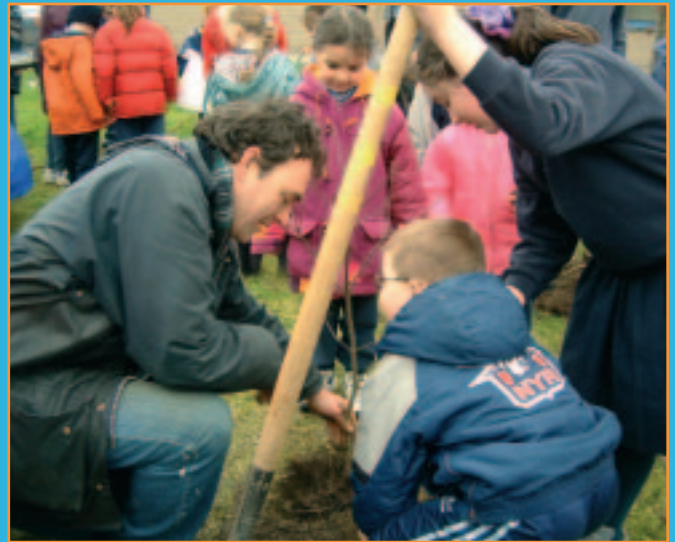
Pupils from Scoil An Tseachtar Laoch help to plant trees

BRL naturally regret that the lombardy poplar tree and indeed the other poplars on the site, cannot be saved despite our best efforts to conserve them. We are only too aware of the need to make the most of the natural assets of the area but the loss of some trees needs to be seen in the context of the extensive new planting programme being undertaken as part of regeneration. The decision to replace the poplar tree with a semi-mature oak tree is in itself symbolic, given the long history and association of oaks with Celtic beliefs.