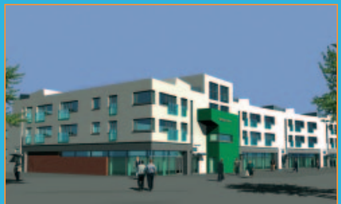
Proposed Shangan Neighbourhood Centre

D esigns are at an advanced stage for neighbourhood centres in Coultree, Poppintree, Shangan and Sillogue. Planning applications have been submitted for Coultree, Shangan and Poppintree.