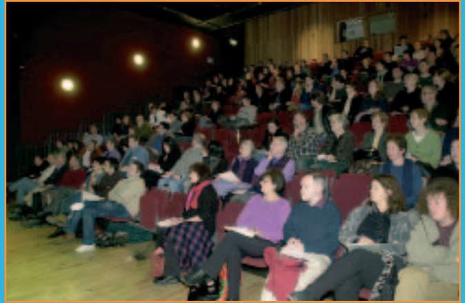
participants attending Breaking Ground Seminar