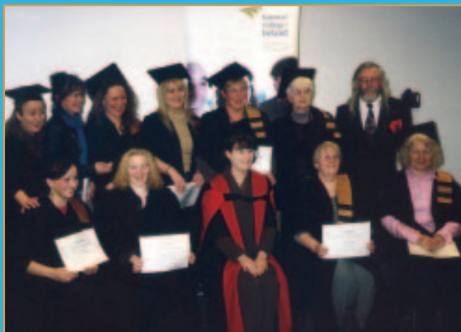
Oral History Participants received certificates from NCI

C ongratulations to all those who were involved in the recently completed History Project lead by Eneclann, who were employed as consultants by BRL. The Oral History strand of the project was very worthwhile and the board of BRL has agreed to provide more funding so that further stories can be recorded and written up. The Oral History Steering Committee is to be congratulated for their part in the overall project and for taking the project to a new level with the establishment of an Oral History Association.