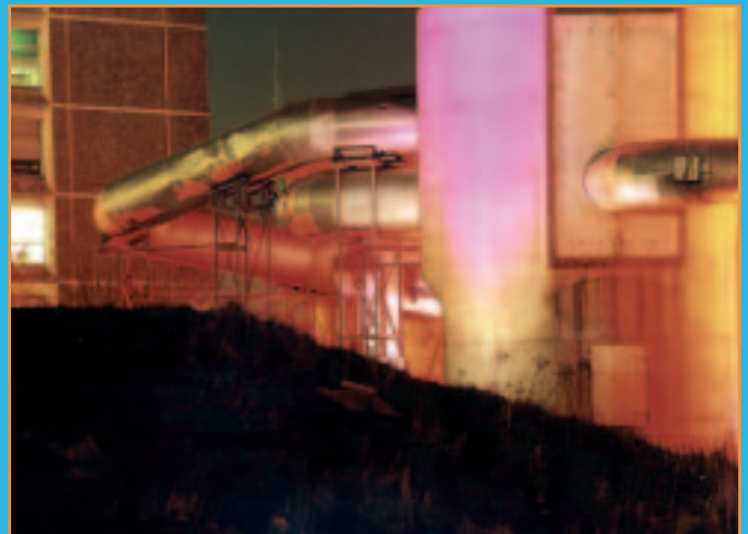
Ballymun Boilerhouse 'Illumination'.

For further details, contact Aisling Prior at BRL's office in Stormanstown Hse (8421144).