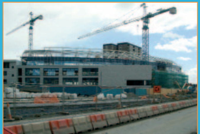
Civic Offices building work underway

Andorey Developments have commenced building the ARP Lorimar designed Gateway housing which will provide private sector and local authority accommodation. The designs won an international Royal Institute of Architects in Ireland (RIAI) competition in 1999. Planning permission has just been granted for the Business Park being developed by Ballymun Regeneration in a joint venture with Green Property Plc. The €762 million development, at the Ballymun junction, fronting the M50 and Ballymun Road, will have huge potential for local employment. Site development work is expected to start soon.