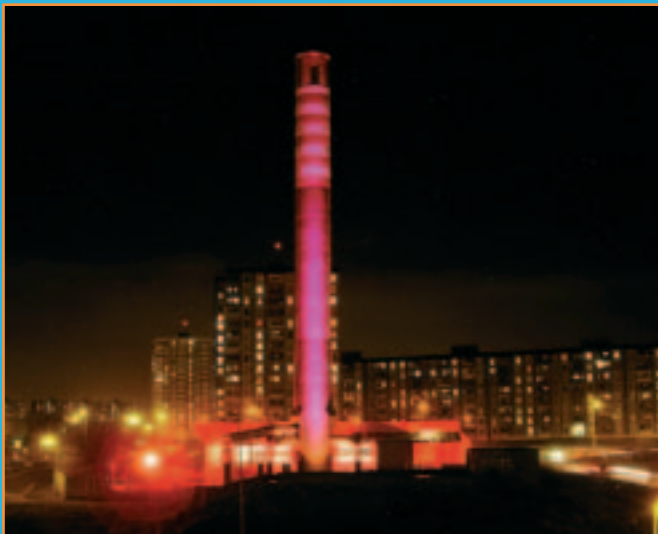
Ballymun Boilerhouse 'Illumination'.

If you have been wondering why the boiler-house is lit in pink and red every night since St. Valentines Day, it's because Andrew Kearney, international artist, illuminated the landmark boiler house to launch "Breaking Ground", the biggest local authority art commissioning programme ever undertaken in Ireland. It's all part of the Department of the Environment and Local Government's Per Cent for Art scheme which provides that all public construction projects can spend one per cent (1%) (up to a maximum of €63,500 per contract) of the total capital cost on art. "Breaking Ground" has an initial commissioning budget of €600,000. Over the 10 year life of the Ballymun Regeneration Limited programme, a diverse range of art projects will help regenerate the new town.