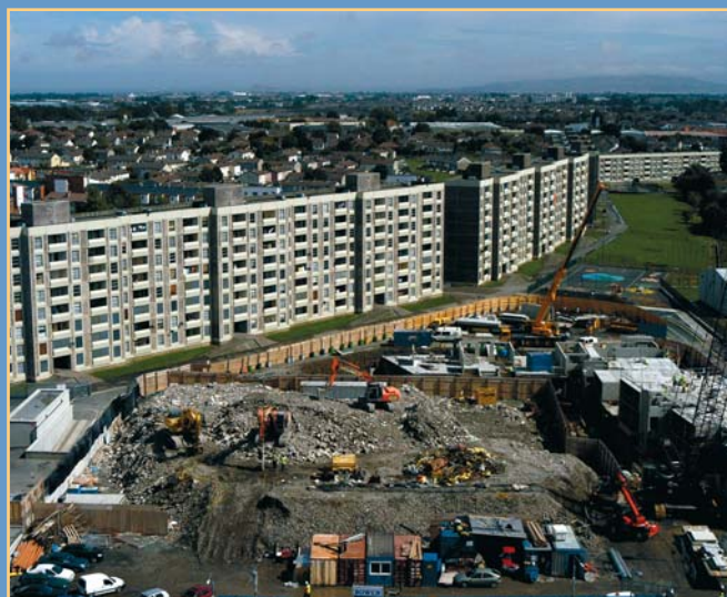
Pearse Tower has now been successfully demolished.

Ballymun Regeneration Ltd (BRL) Civic Centre, Main Street, Ballymun, Dublin 9 ph: 01 675 5660 fax: 01 842 1443 Web: www.brl.ie