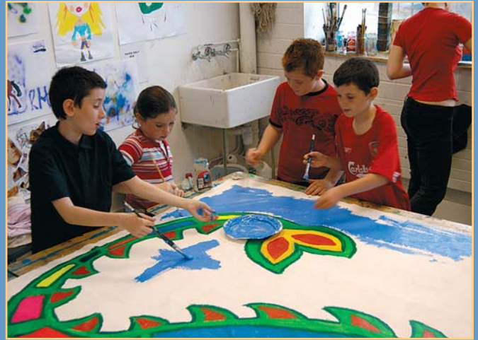
Children working together painting a large dragon on canvas during the Summer Painting Project in AXIS