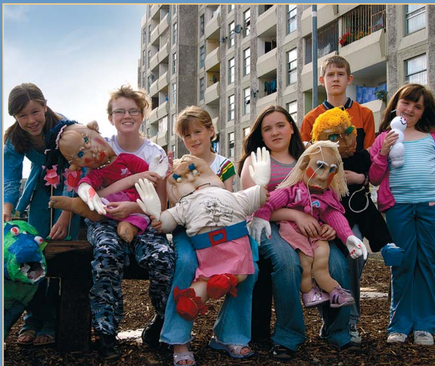
Participants and the figures they made during the Summer Sculpture Workshop