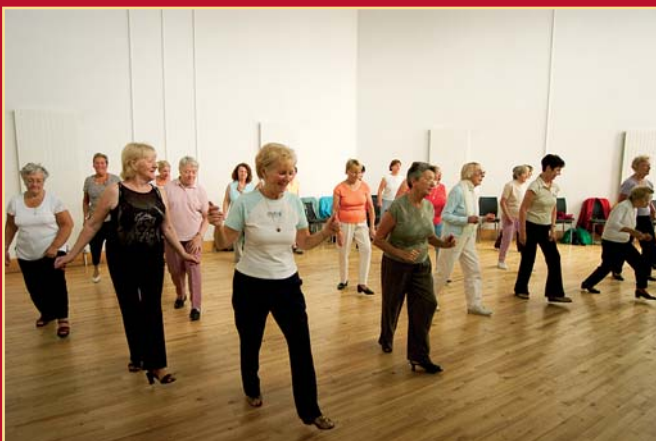
The Active Living dancing class in Axis Centre