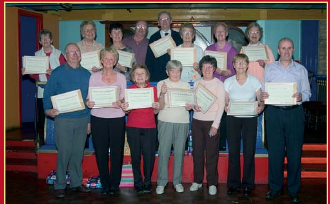
The Tuesday afternoon Active Group awarded certificates at the Active Living Halloween Tea Dance