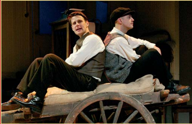
A scene from 'The Green Fool' by Patrick Kavanagh