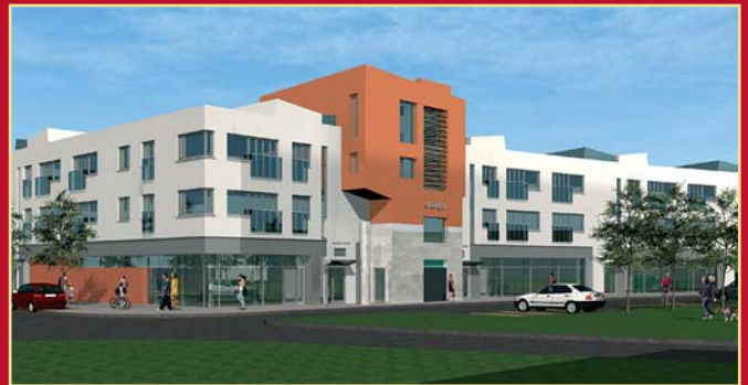
Shangan Neighbourhood Centre

The Poppintree Park designs have been considered by the North West Area Committee of Dublin City Council and it is hoped to have sketched proposals on display for public comment this November.