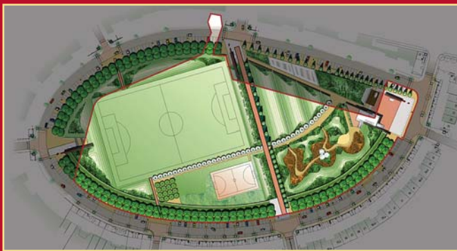
Coultry Park - Phase 1 highlighted

The first phase of the redevelopment of Coultry Park started on site during the week of 27th September 2004. The design was developed in consultation with residents from Coultry and Shangan. The improved park will provide the community with facilities for recreation, sport, leisure, activity, play and relaxation, along with CCTV cameras and public lighting. During the works, the football pitch is being temporarily relocated to Naul Park.