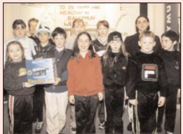
Pupils from Scoil an tSeachtar Laoch, winners of the Ballymun Schools Arts Competition.