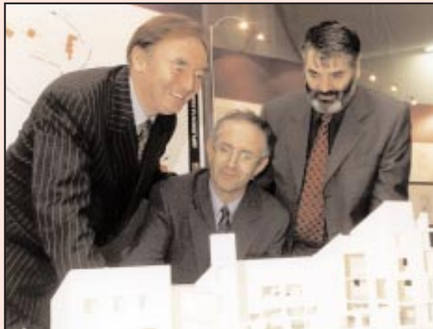
Commissioner Pádraig Flynn, Ciarán Murray and Proinsias De Rossa admiring models of the proposed new homes.

Commissioner Flynn praised the TD's and Councillors for the area, saying the regeneration wouldn't have happened without them. And he reminded people to be sure and take pictures of the towers just before they are demolished, so the memories of all the good times in Ballymun can be carried forward into the next stages of their lives in the new town.