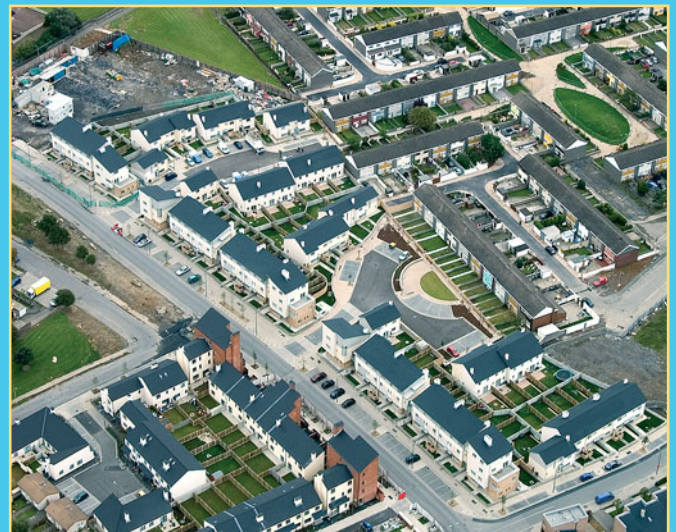
New housing - Balcurris 2

Poppintree 4, development located at the north of Belclare Park and bordered to the North by Balbutcher Lane, comprises 11 houses and 14 apartments, which will be completed in September. 25 families from Thomas