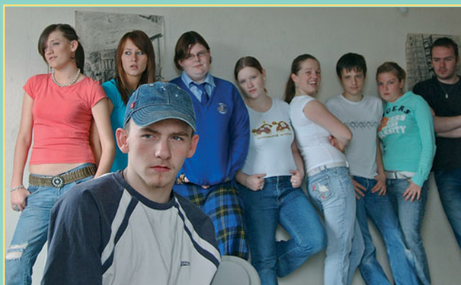
Tumbledowntown , a Performance Lab/Roundabout Youth Theatre production, and a Breaking Ground 2

(BG2) commission, has just won the Spirit of the Fringe award, the main award of the Dublin Fringe Festival.