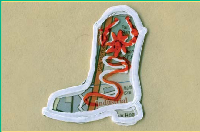
Cowboy Wellies, one of the works from the exhibition