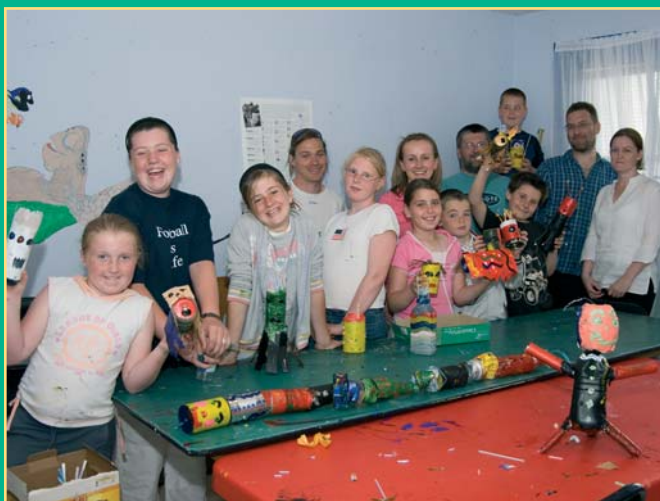
Recycling the unrecyclable

The Rediscovery Centre launched the first in a series of pilot 'Art From Waste' Projects on July 19th in Ballymun with the creation of some