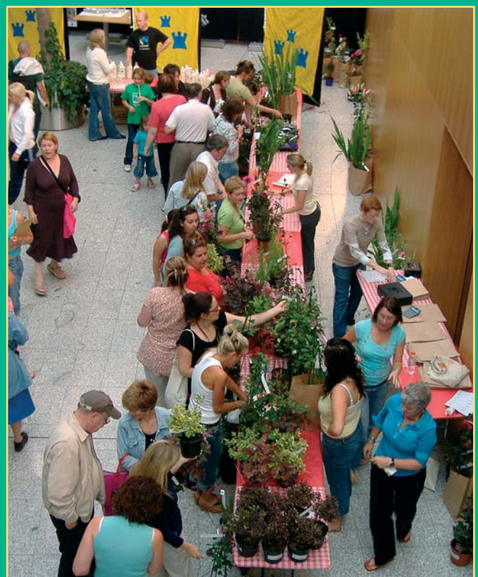
Local residents browsing and purchasing at plant sale

If you have any queries about upcoming events or would like to find out more about GAP Garden Action Teams or Action Teams just ring the GAP Office on 01 862 5846.