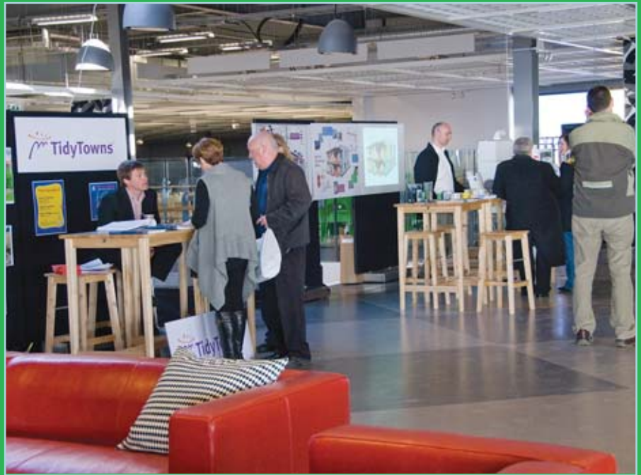
The opening of the Ballymun Environmental Fair at the new IKEA store