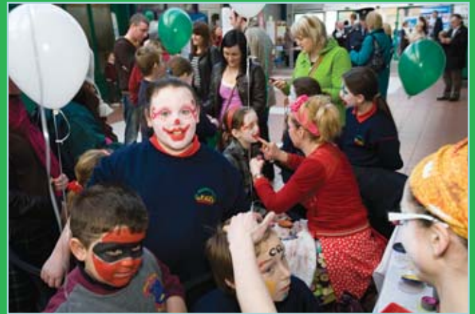
Face painting at the launch