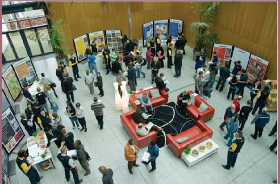
Ikea jobs fair Ballymun Civic Offices Atrium