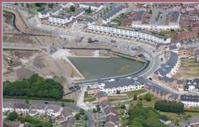
Aerial view of Poppintree Park Phase 1

We would like to take this opportunity to thank all those in the community for their contribution in the maintenance of the parks and greens in the area.