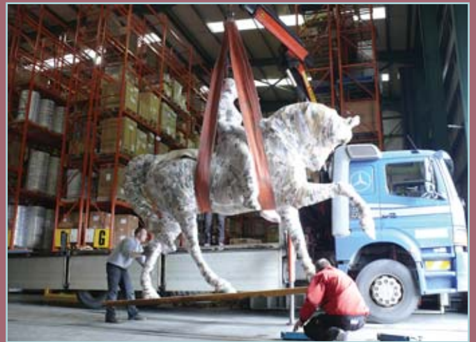
John Byrne horse arrival

These fascinating stories cover a wide range of issues, including alcoholism, sexual and physical abuse,