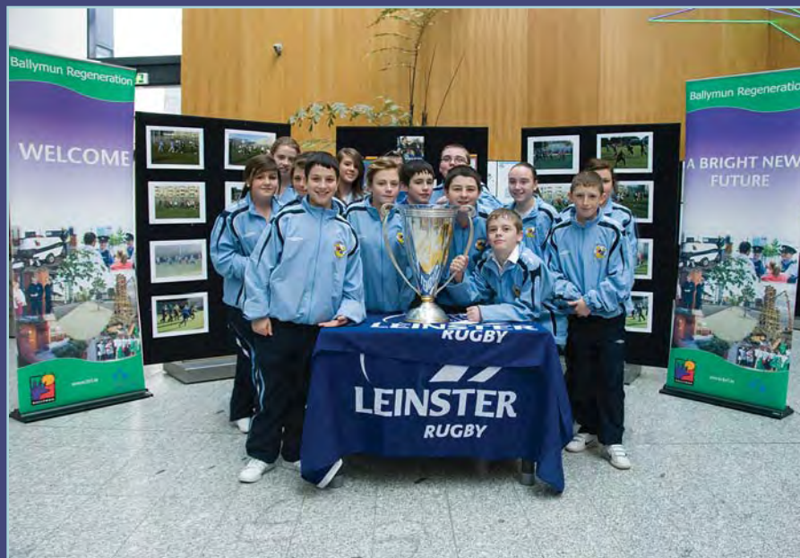
Some excited Trinity Comprehensive sports students see the European Heineken Cup for the first time in the Ballymun Civic Centre Atrium. See page three for article.