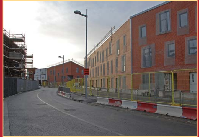
New housing in Shangan

Tenders for the Coultrey 6 housing scheme will go out in January 2012 and construction is expected to start in April. The Coultrey 6 scheme is a 15 month contract for