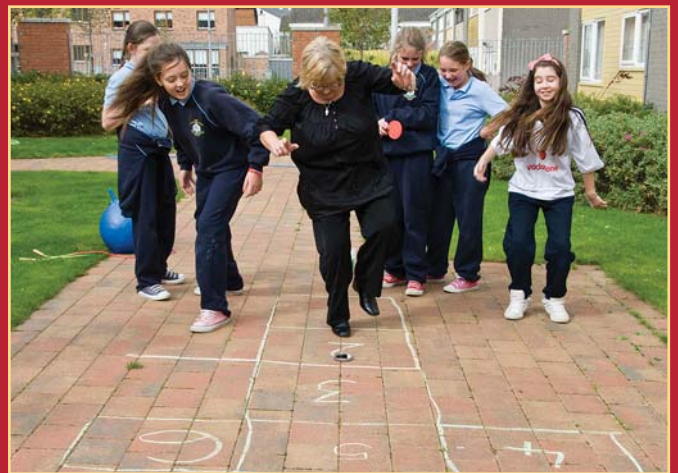
'Intergenerational Playday 2011' - an activity that can help to activate your street for 'play'!

If you would like to nominate your street to participate in Play Streets 2012, please contact Debby Clarke, BRL Play and Development Officer @ 01 222 5609 by February 2012.