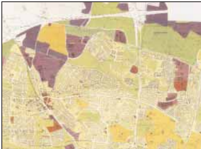
1991 Development Plan